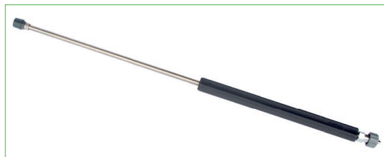
Single stainless steel lance with high pressure nozzle and rotating quick coupling code : 1.216.729.xxxx