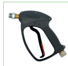
High pressure gun with swivel code : 1.211.525