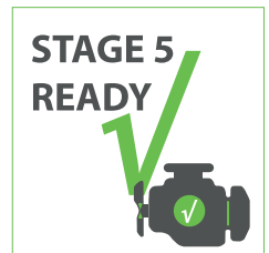
All engines comply with the latest emission standard