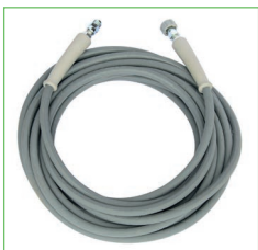
10 m high pressure hose (3/8") code: 1.653.020